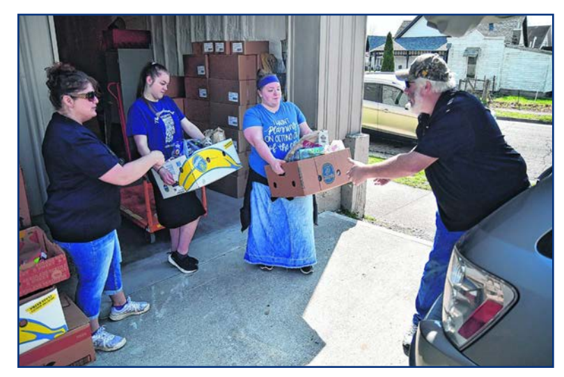
Volunteers help load food for distribution at the Anchor House pantry. Anchor House received a $15,000 Fall Grant in 2022 to help fund the pantry and other services to residents across Jackson County.

Anchor House now operates two homeless shelters in addition to the food pantry, which serves about 400 households monthly. The Foundation also provided Impact Grant dollars to Anchor House in