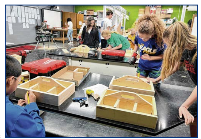
Crothersville eighth-graders work on making their own nail boxes.

Through this project, students learned how to use the power tools and how to build the exterior of a nail box. Once they had four sides cut, they worked on the handle. Math was among the lessons involved because they had to figure the circumference of the handle, determine the halfway point and make angles by reading the plan.