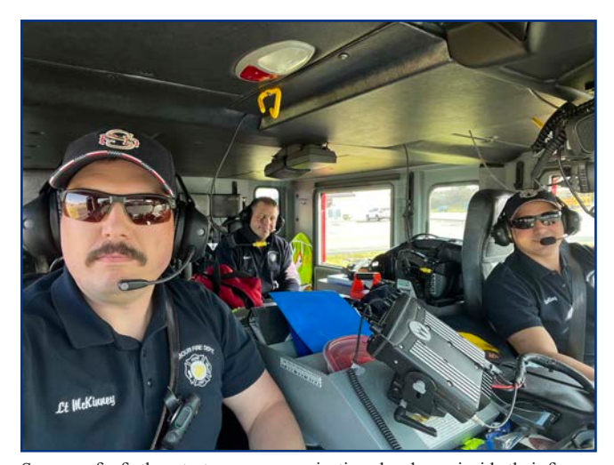
Seymour firefighters test new communications head gear inside their fire truck. Seymour Fire Department received a $6,200 Fall Grant in 2022 to purchase communication headsets designed to improve firefighter safety and improve communications both while running to emergency scenes as well as while responding while on the scene.